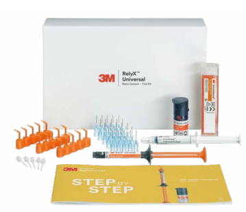
3M™ RelyX™ Universal Resin Cement Trial Kit TR (56969)