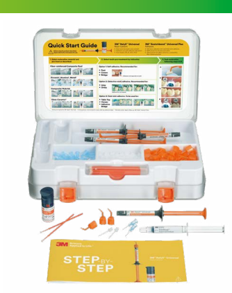
3M™ RelyX™ Universal Resin Cement Intro Kit (56968)

2 x 3M™ Scotchbond™ Universal Etchant (3 ml each), 50 x dispensing tips